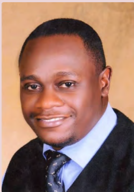
BY PASTOR RONNIE MUTEBI

G enesis 8:22(KJV): While the earth remaineth, seedtime and harvest, and cold and heat, and summer and winter, and day and night shall not cease.